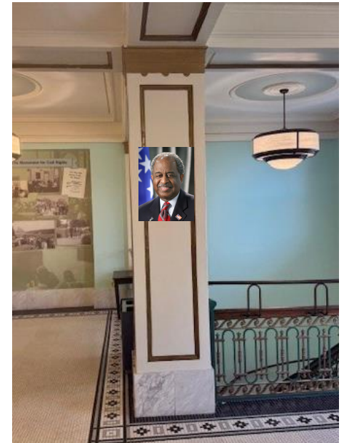
Option 3 – Left column in center of room when entering from the elevator.