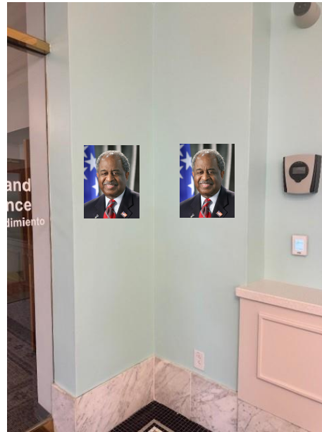
Option 2 – Right wall corner when entering from the elevator on either wall side.