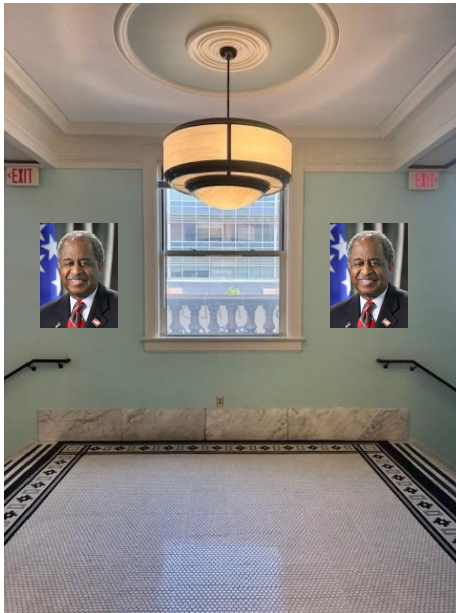
Option 1 – Facing the entry point when you enter from elevator on left or right side.