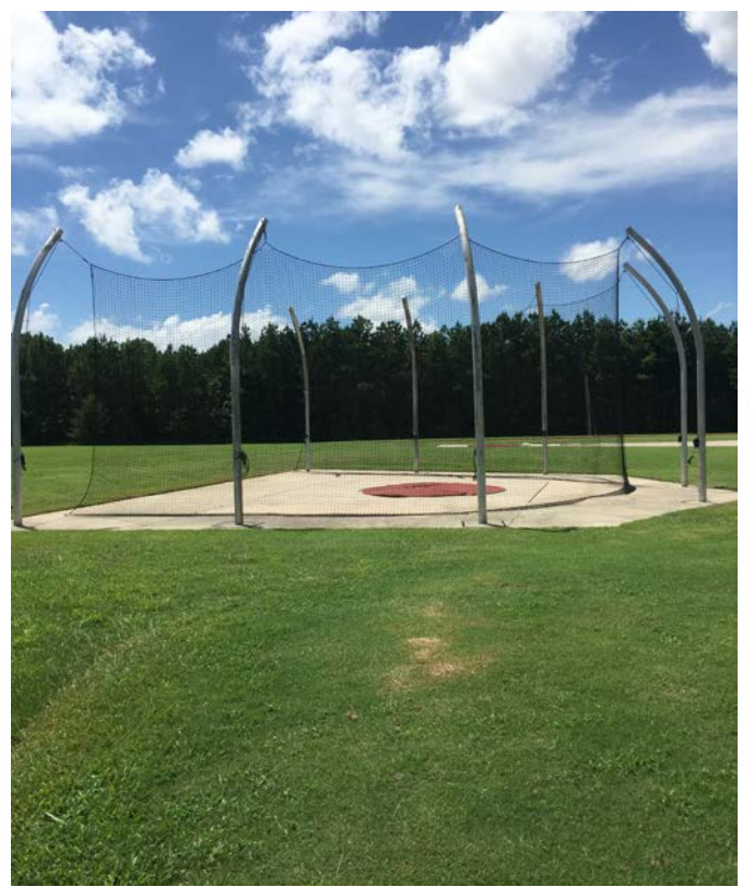
Current Javelin and Discus Cage