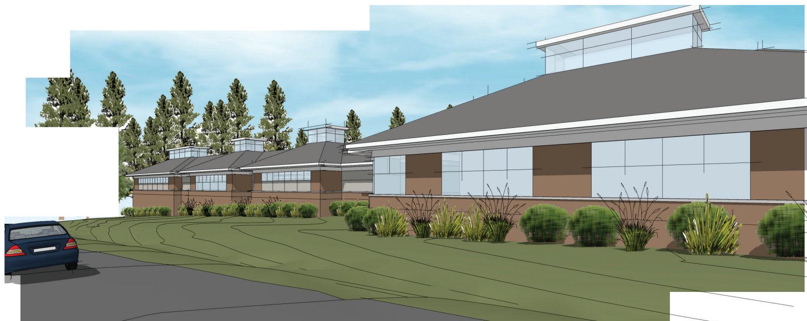
NORTHWEST VIEW ALONG BROAD STREET