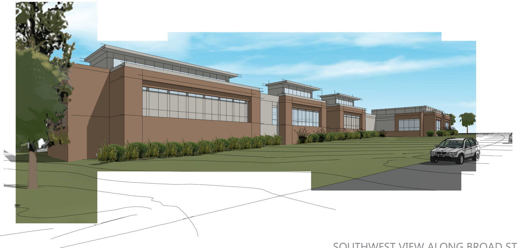
SOUTHWEST VIEW ALONG BROAD STREET