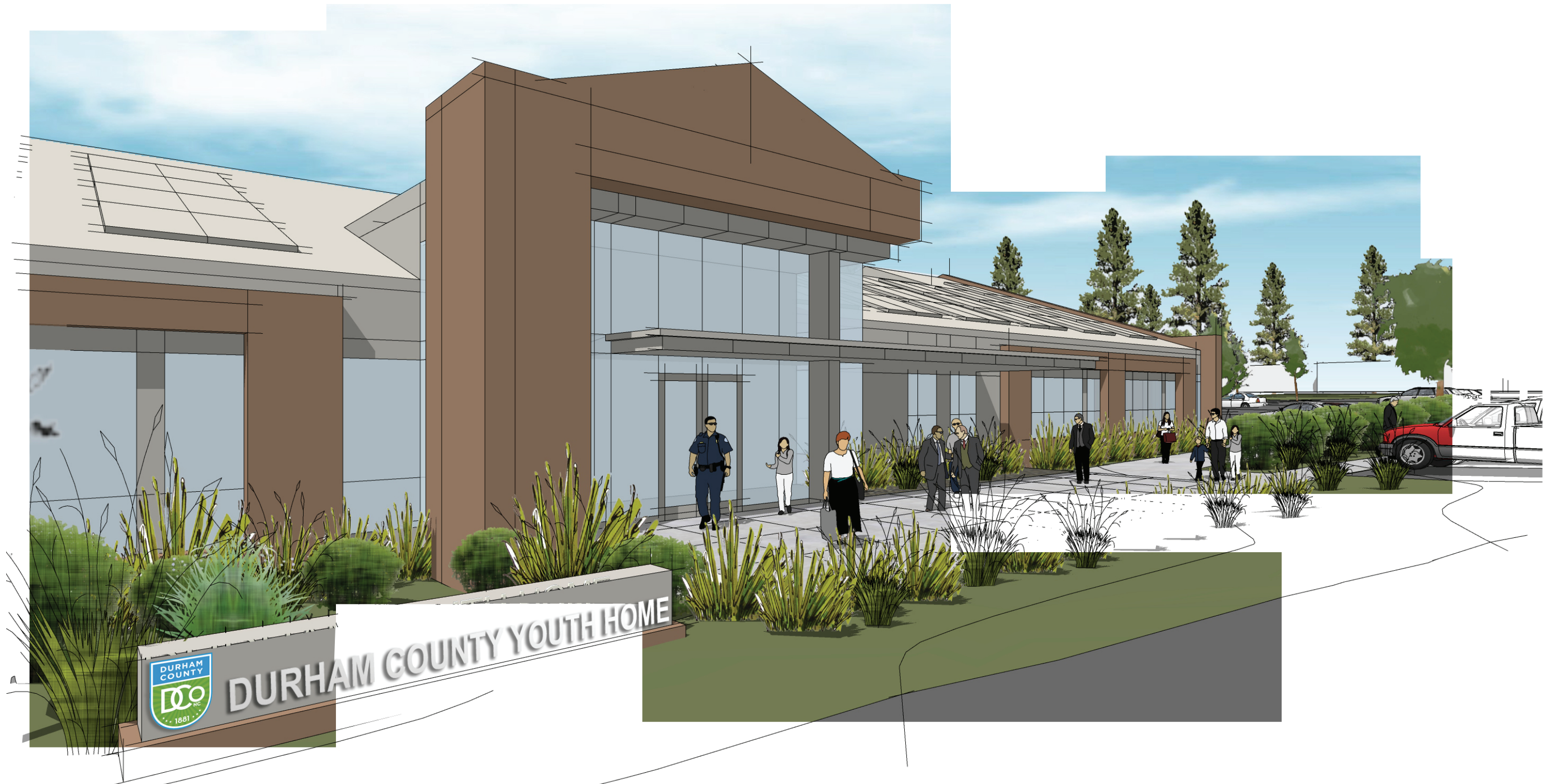
EXTERIOR DESIGN OPTION 2 SOUTH PERSPECTIVE/MAIN ENTRY