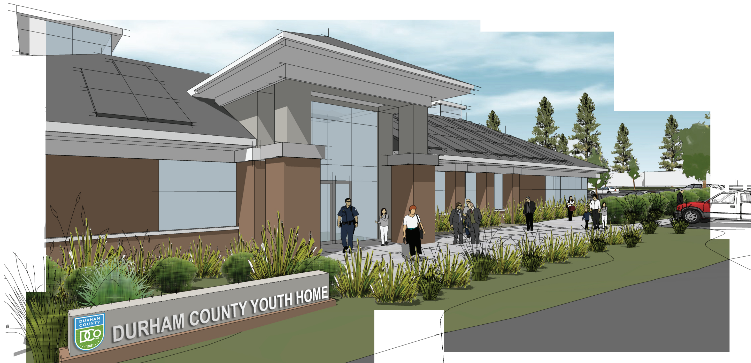
EXTERIOR DESIGN OPTION 1 SOUTH PERSPECTIVE/MAIN ENTRY