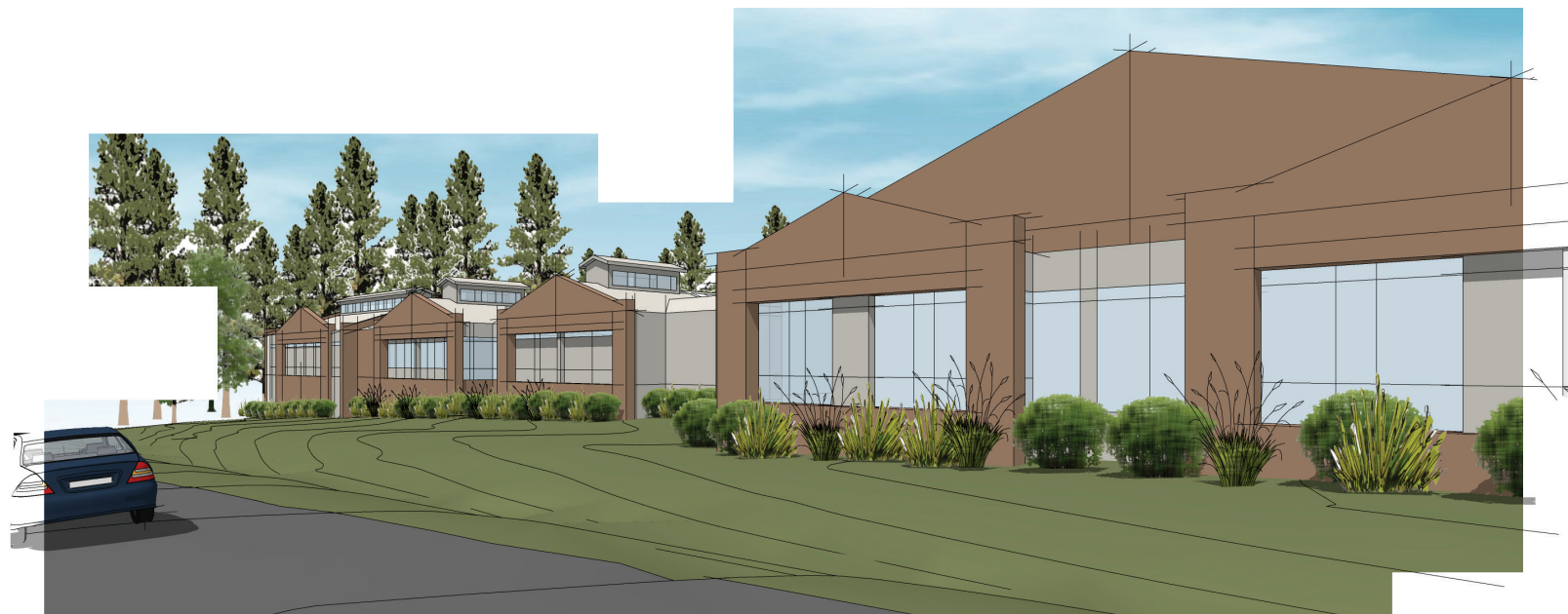
NORTHWEST VIEW ALONG BROAD STREET