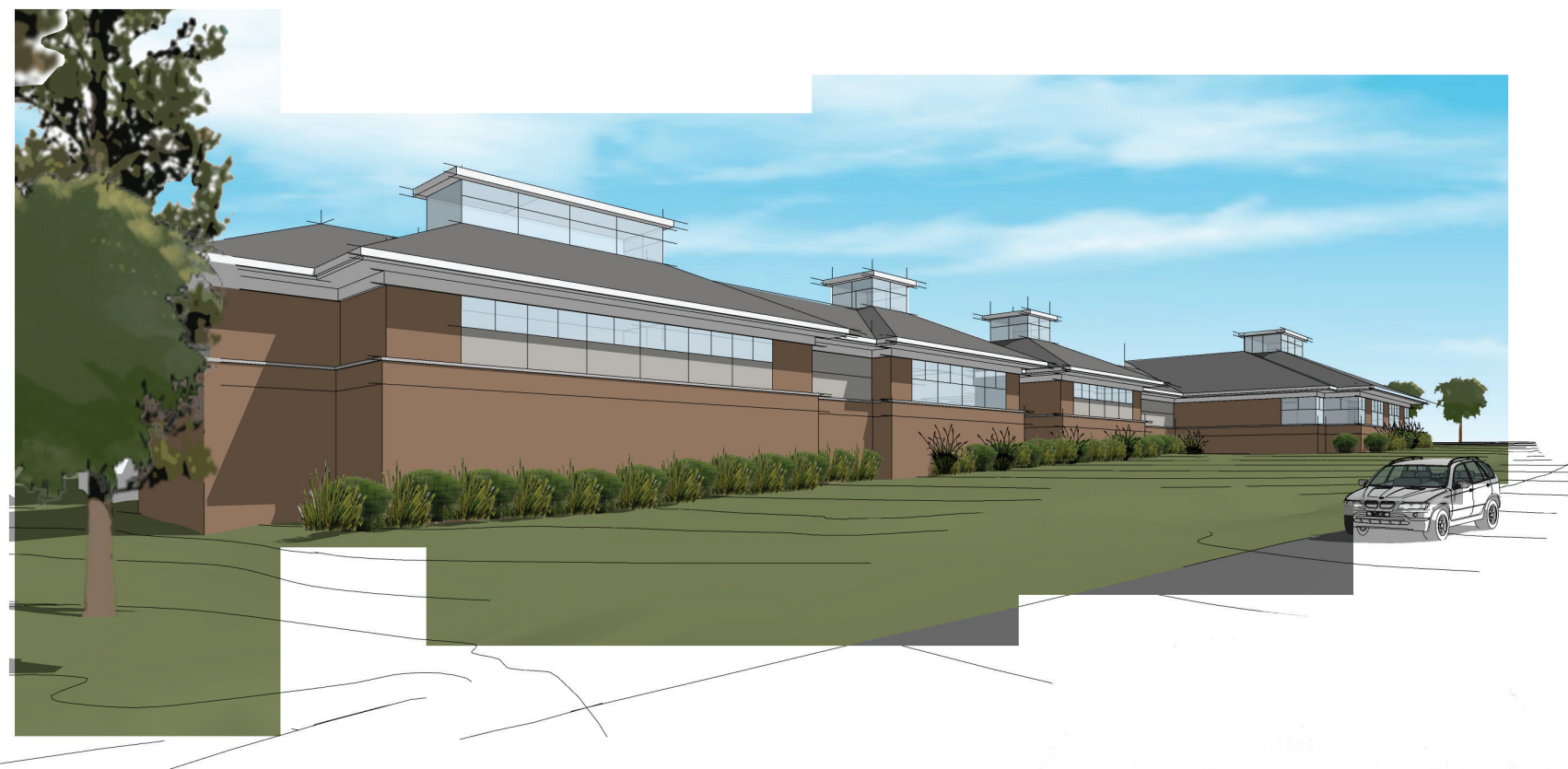
SOUTHWEST VIEW ALONG BROAD STREET