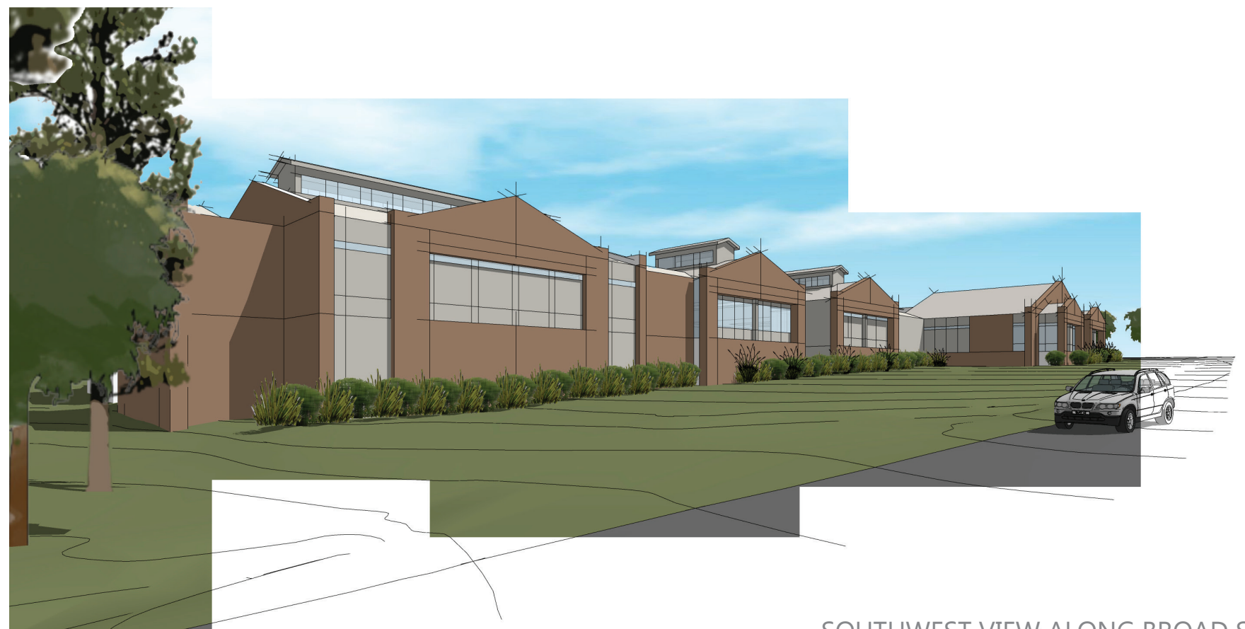
SOUTHWEST VIEW ALONG BROAD STREET